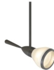
Antique Bronze With Round Glass Shield Accessory